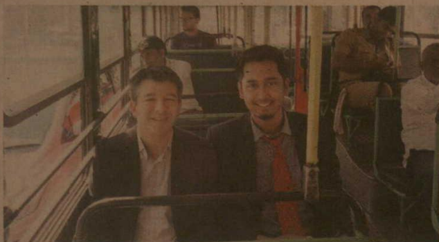
Uber CEO Travis Kalanick (left) on his way to IIT-Bombay in a BEST bus on Tuesday

"You are smart, you have a roof over your head... if this doesn't work out, there are a thousand companies who will hire you," he quipped in what